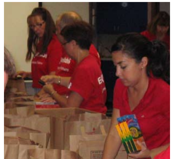
ExxonMobil volunteers help prepare school supplies for distribution

A special thank you to the Houston Zoo ACCESS program and Channel 13 for donating 1,250 tickets. These tickets were distributed to elementary students to enjoy a visit to the zoo with their families.