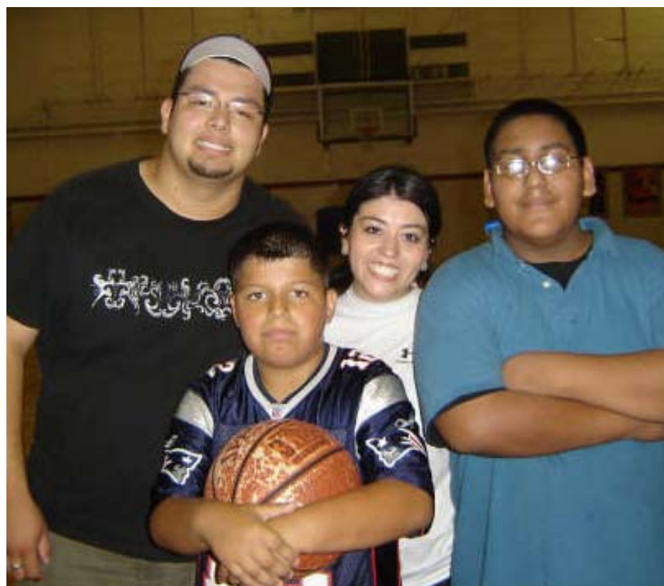
Family Services staff and students from Willowcreek Apartments take a break during the YMCA day program