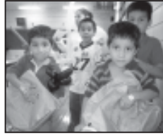
Students received school supplies