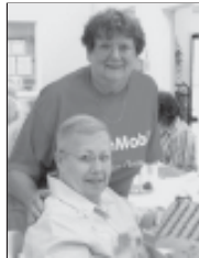
Seniors enjoyed bingo

In conjunction with National Family Week , November 19-25, Family Services was designated as Charity of the Month by Katz's Deli . Family Services received 10% of proceeds when customers used a coupon.