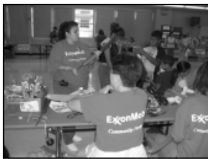
ExxonMobil Volunteers at work

Volunteers from ExxonMobil and Knowledge is Power Program Academy helped provide family-friendly activities such as balloon art and face painting. HEB contributed refreshments for the volunteers and families who attended.