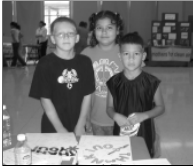
Students who received school supplies

In another collaboration, Family Services' staff members provided students a time to build new skills and dream about the future by participating in a summer version of our award-winning Ensueños del Futuro program at five area Boys and Girls Clubs. The eight week curriculum focused on self-esteem, dealing with stress and handling peer pressure. They also